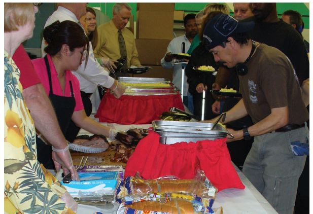
(Above, Below, and Left): Employees of the Lighthouse enjoy the traditional barbeque lunch from Risky's.