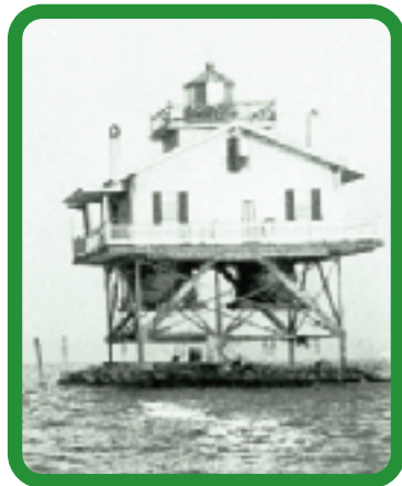
Early drawing of the Cat Island Lighthouse

Louis Daniel presented his 20th drawing of a Gulf Coast Lighthouse that will be used for the unique 2006 Christmas card. Featured will be the Cat Island Light that went into service off the coast of Mississippi near Gulfport in 1831. Over the years, several hurricanes severely damaged the Lighthouse and, after the Civil War, the Lighthouse Board decided to build a screw-pile Lighthouse.